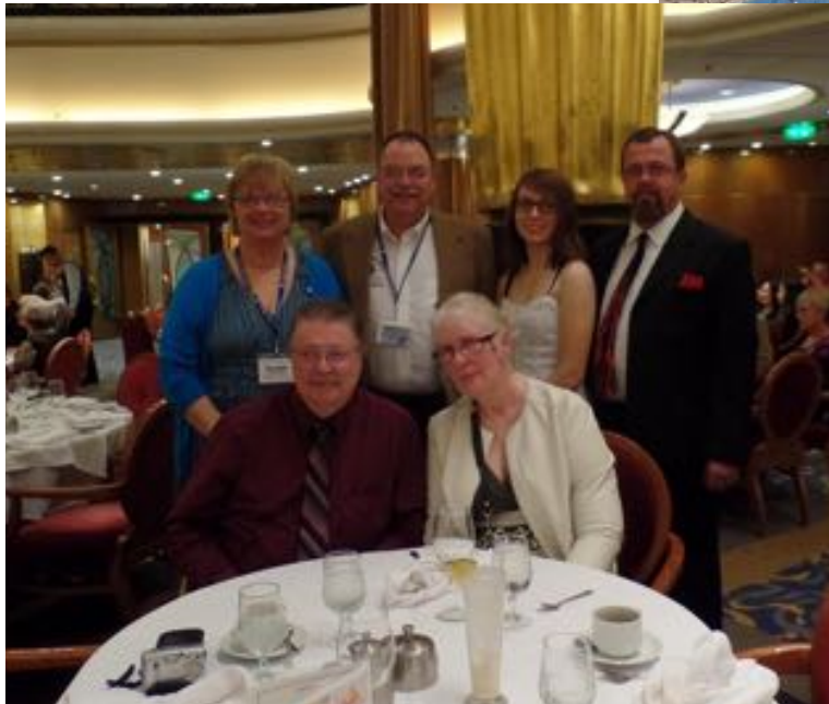
Ports of call included Freeport, Cozumel, and Grand Bahama Island