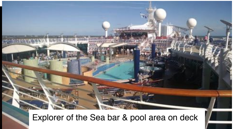
Explorer of the Sea bar & pool area on deck