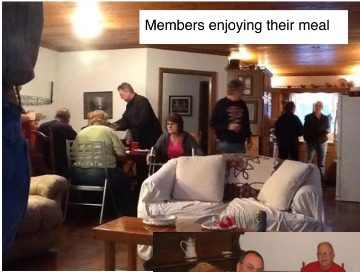
Members enjoying their meal