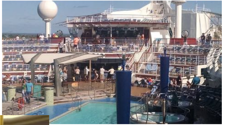
A number of Chapter G members took a break from the Michigan winter weather to enjoy the sunshine and blue waters off the Florida Coast. The last week of January we set sail with over 300 GWRRA Members from throughout the USA.