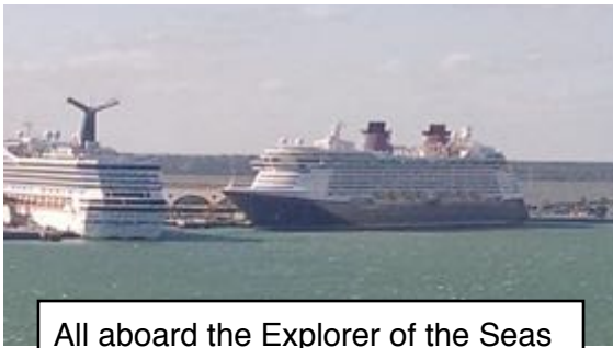
All aboard the Explorer of the Seas