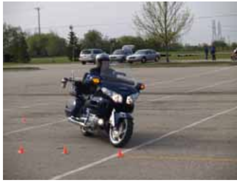
Ezra going thru the cones